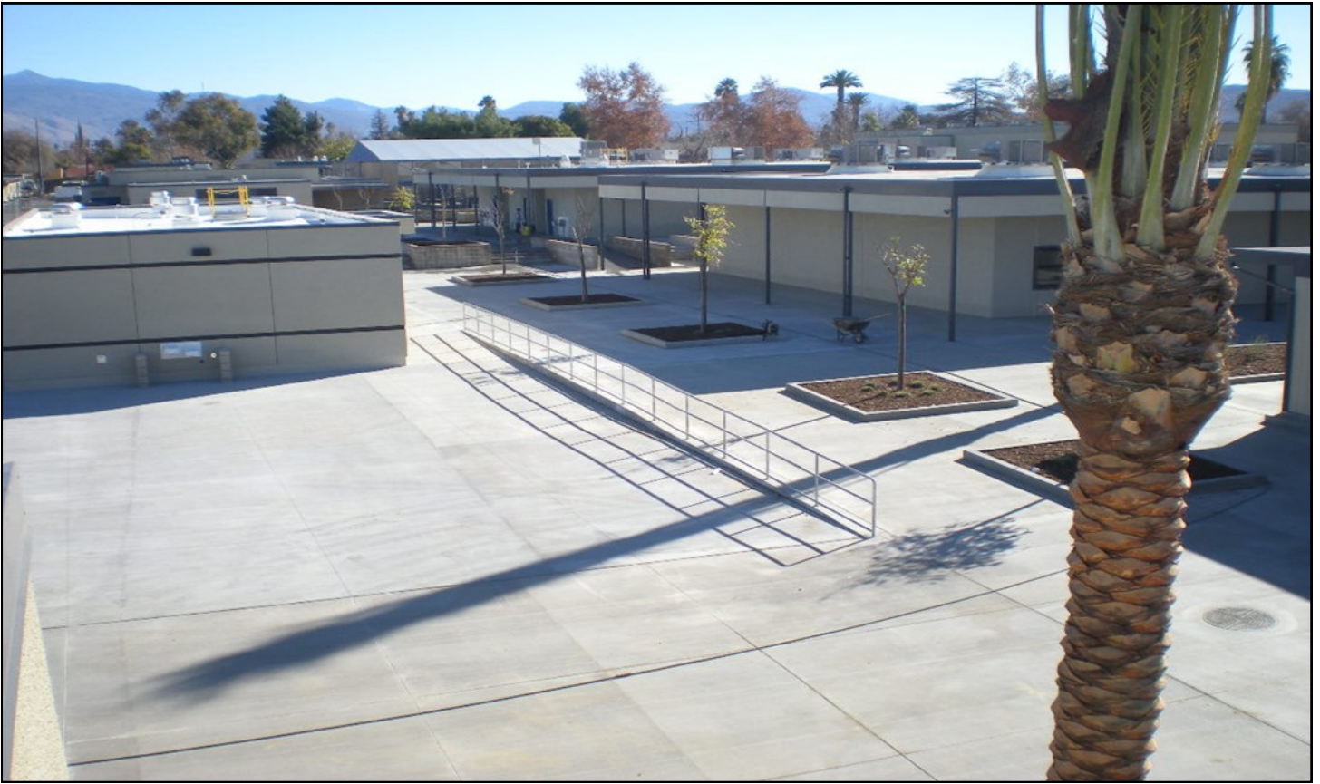
Building B: Concrete is complete and trees have been planted. Concrete and fencing is complete at bike enclosure.