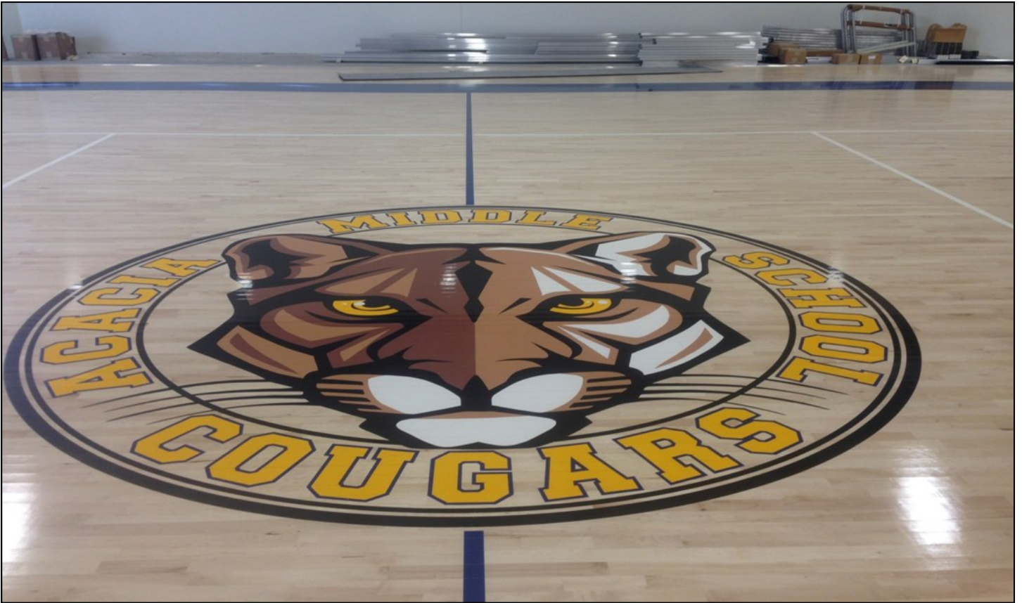
New gym floor is complete with floor mural and striping.