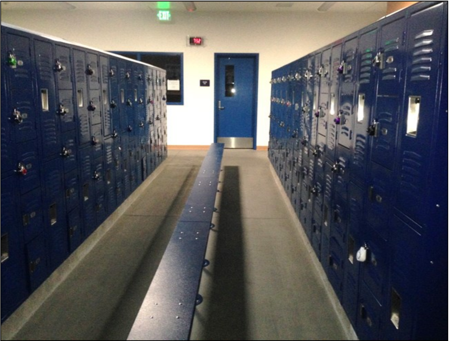
Locker Rooms are finished. Restrooms at Building B are finished as well.