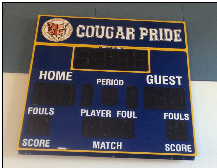
New Scoreboard installed.