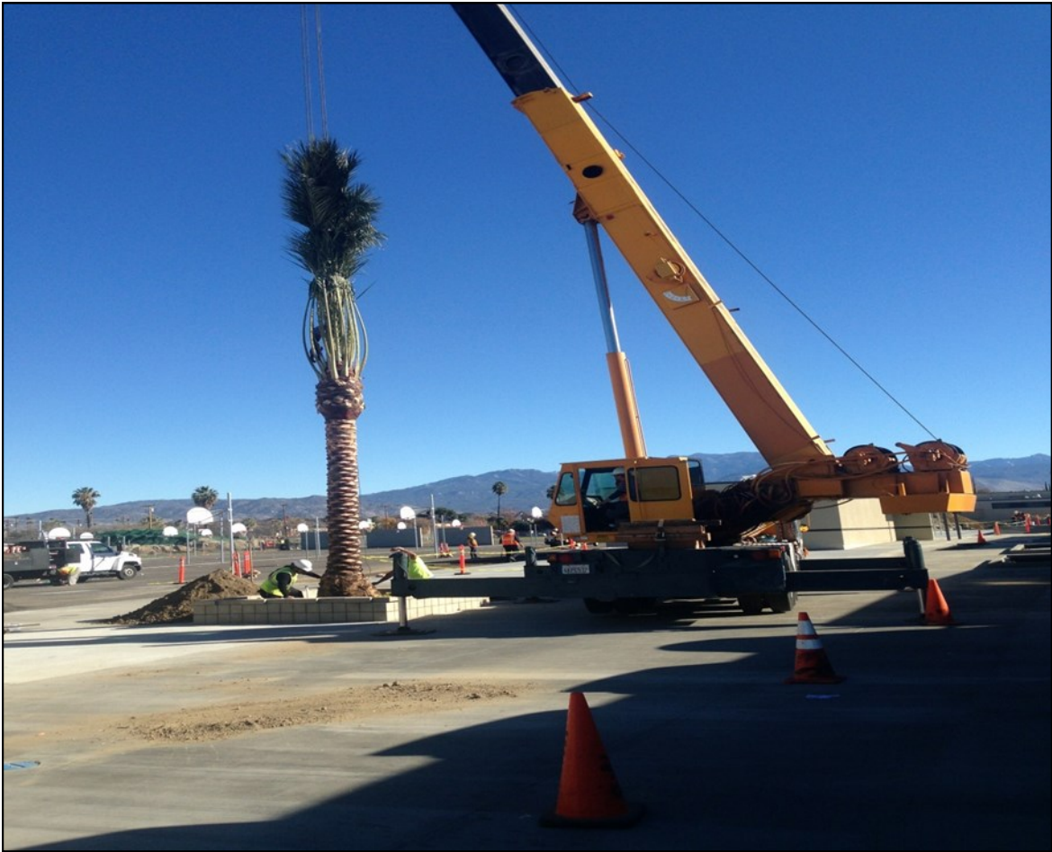
Palm trees have arrived and set with crane adjacent to Building B and between Buildings 600 & 700