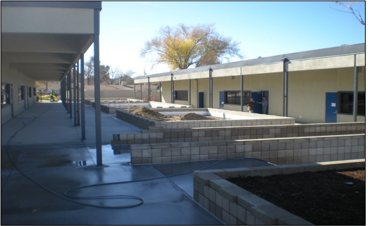
Building 500 & 600: Set rebar and concreted poured.